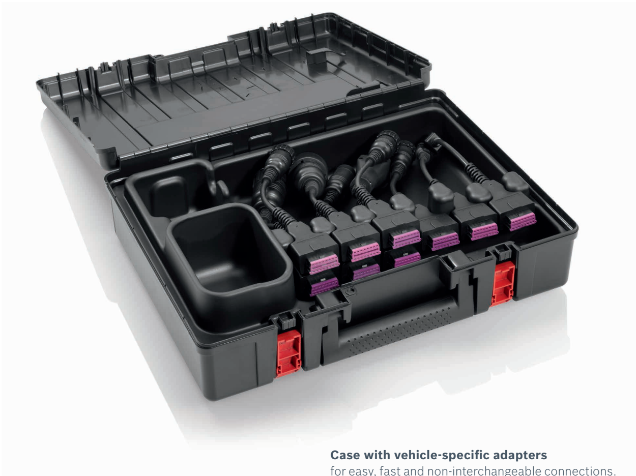
Case with vehicle-specific adapters for easy, fast and non-interchangeable connections.

“Easy Connect” significantly simplifies the connection of the KTS Truck diagnostic module to the vehicle. KTS Truck can be directly connected to the OBD socket via “Easy Connect”. Thanks to vehicle-specific adapter lines, the device can be connected to vehicles without an OBD socket just as easily. The adapters are non-interchangeable to enhance efficiency. Adapters are developed further in accordance with the vehicles covered by the diagnostic software. Thanks to the modular “Easy Connect” concept, workshops are set up for the future.